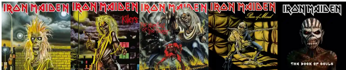
1980 Iron Maiden

Iron Maiden (formed in London, 1975 and still performing) are classified in this category. Of interest, lead singer Bruce Dickinson is a qualified airplane pilot.