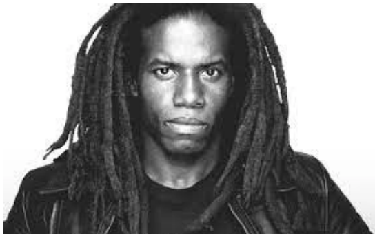
Jimmy Cliff: one of the more commercially successful artists to emerge. Songs Include "Vietnam"(1970), "Many Rivers To Cross"(1969), "Wild World"(1970), "You Can Get If You Really Want"(1970), "The Harder They Come"(1972)